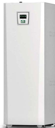
CTC EcoPart 400 Pro * Basic