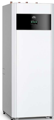
CTC EcoPart i600M * Basic