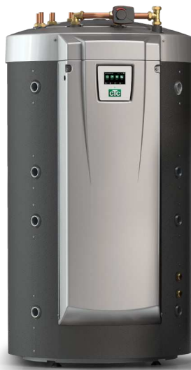
CTC EcoZenith i555 Pro * Basic